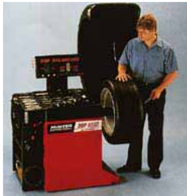
Balanceo x computadora

Un balanceo dinámico es balancear las llantas delanteras con el rin montado en el auto, encendido el auto y acelerando para hacer girar solo la llanta que queremos balancear, así los técnicos aumentarán y quitarán plomo de acuerdo a la vibración que se presente en el volante al acelerar.