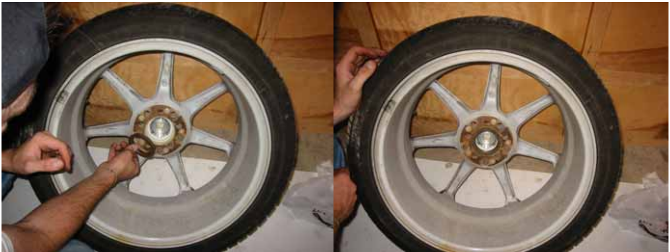
Se pueden colocar en el rin

La forma de colocar estos se ilustra a continuación: