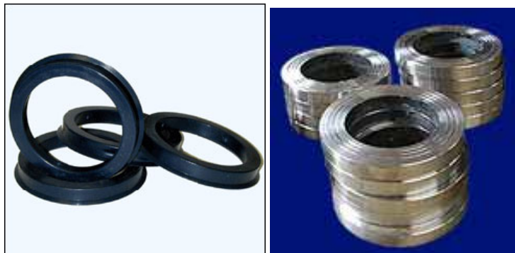
Centradores (izquierda de plástico, derecha aluminio)

En la mayoría de los casos (no solo en el chevy), se requieren centradores (algunos los llaman “aumentos”) ya que el rin cuenta con un centro demasiado grande para la masa del disco, es por esto que se incluye un centrador (uno por rin) a fin de llenar este espacio del rin. Los hay de varios materiales como lo son acero, plástico y aluminio, este último es el más adecuado por su peso y resistencia.