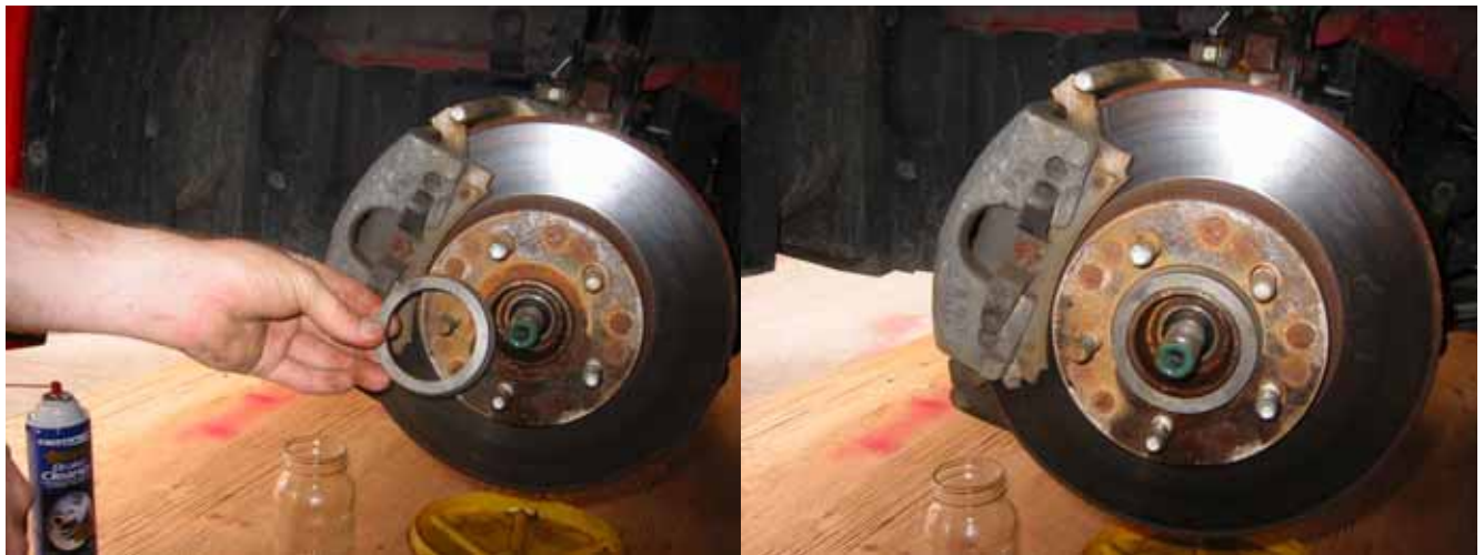
O bien en la masa, el resultado es el mismo.